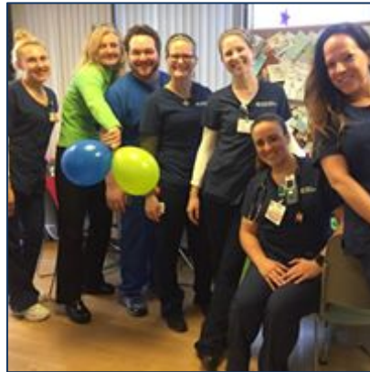
The Decorating Committee(s)