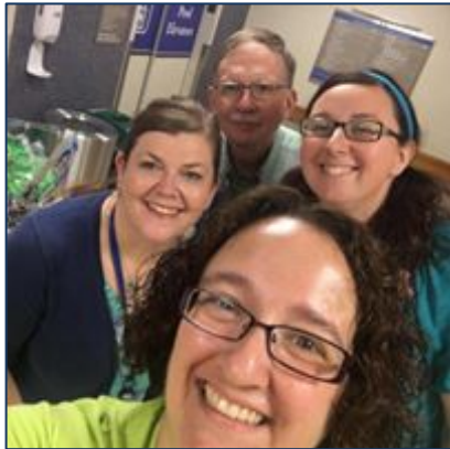
The Steering Committee